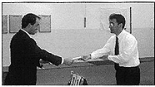
The Centre Referee hands the forms to the Jury President.

After the bout the Centre Referee stands in the centre of the square, waits for the Corner Referees to collect their scoring forms and then hands them to the Jury President.