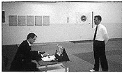
The Centre Referee stands one (1) metre away in front of the Jury Table