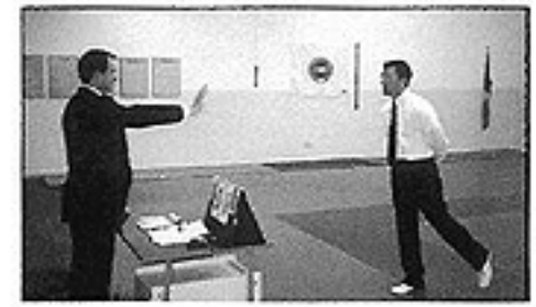
The Jury President sends the Centre Referee back to the Centre of the Ring